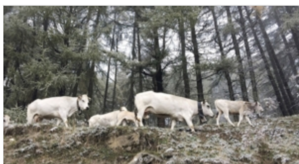
New air for the Piedmontese