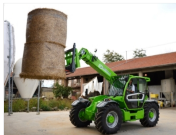
Merlo Lifters, the High Capacity family grows