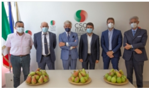
Pere, Unapera was born for the relaunch