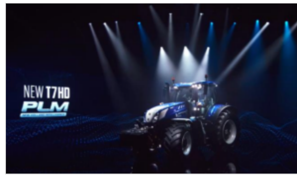
T7 Heavy Duty with PLM: the power of intelligence