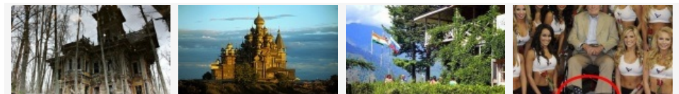
7 Creepiest places that can give you chills 5 endangered tourist treasures A new Russian tourist season in India What you need to know about George H.W. Bush