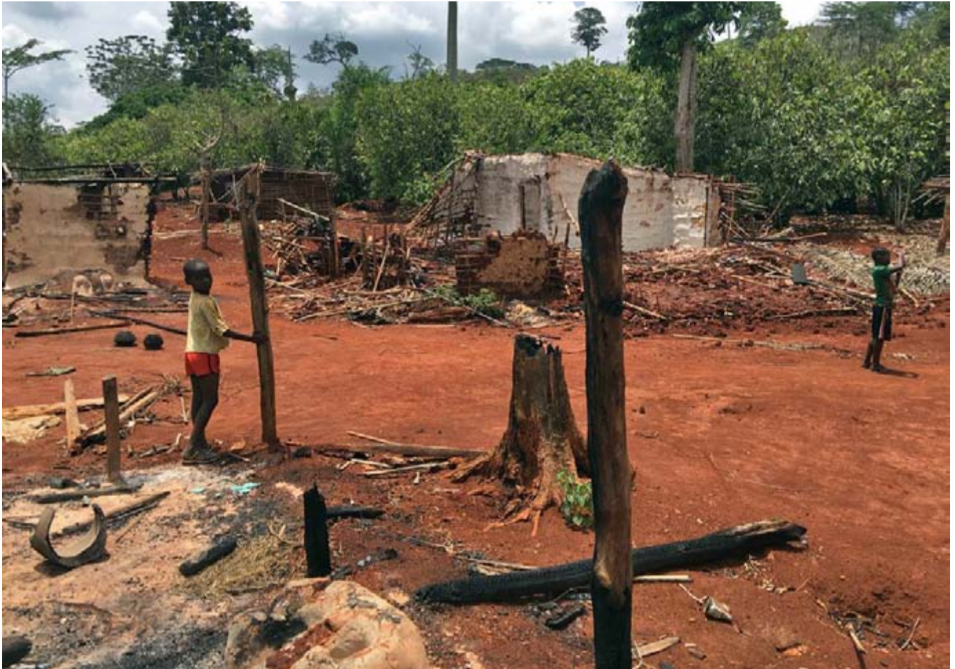
Two children standing amid the rubble of burned houses after a forced eviction in January 2016, in the Goin-Débé classified forest, in Côte d'Ivoire.

compensated for loss of land rights in 1979. All that the government has done is to issue a series of decrees indemnifying peasants whose crops were destroyed to make way for the sugar complex