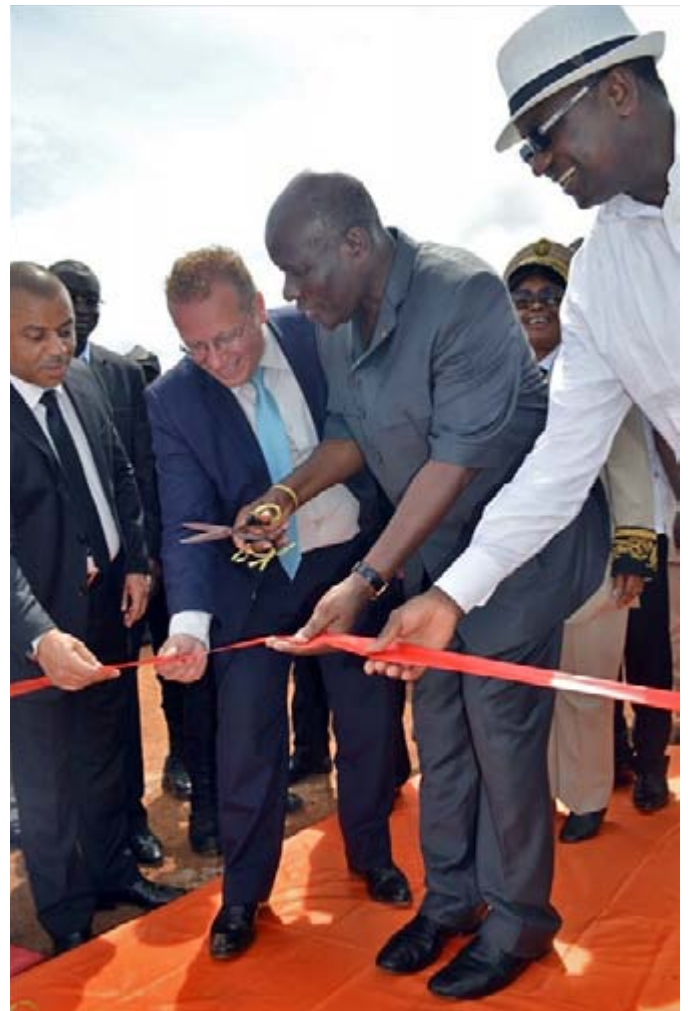
Rubber plantations and food crops: the minister of agriculture and CHP’s managing director at the official launch of the project in Prikro, in 2013.