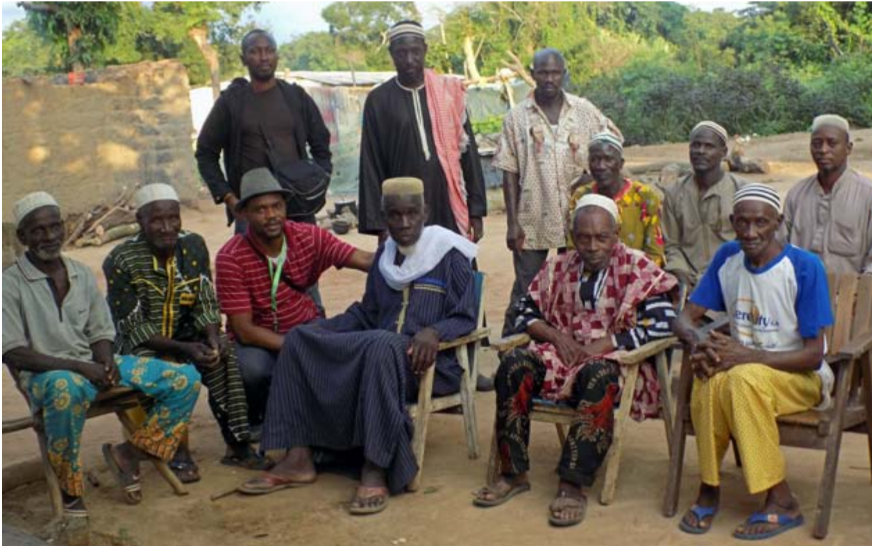
Meeting of community members affected by the rubber plantation.

“Our ancestors were born here and cultivated the land with the sole purpose of feeding themselves. The land was neither sold nor bartered. By what right can they take our land away and grant ownership to others?”