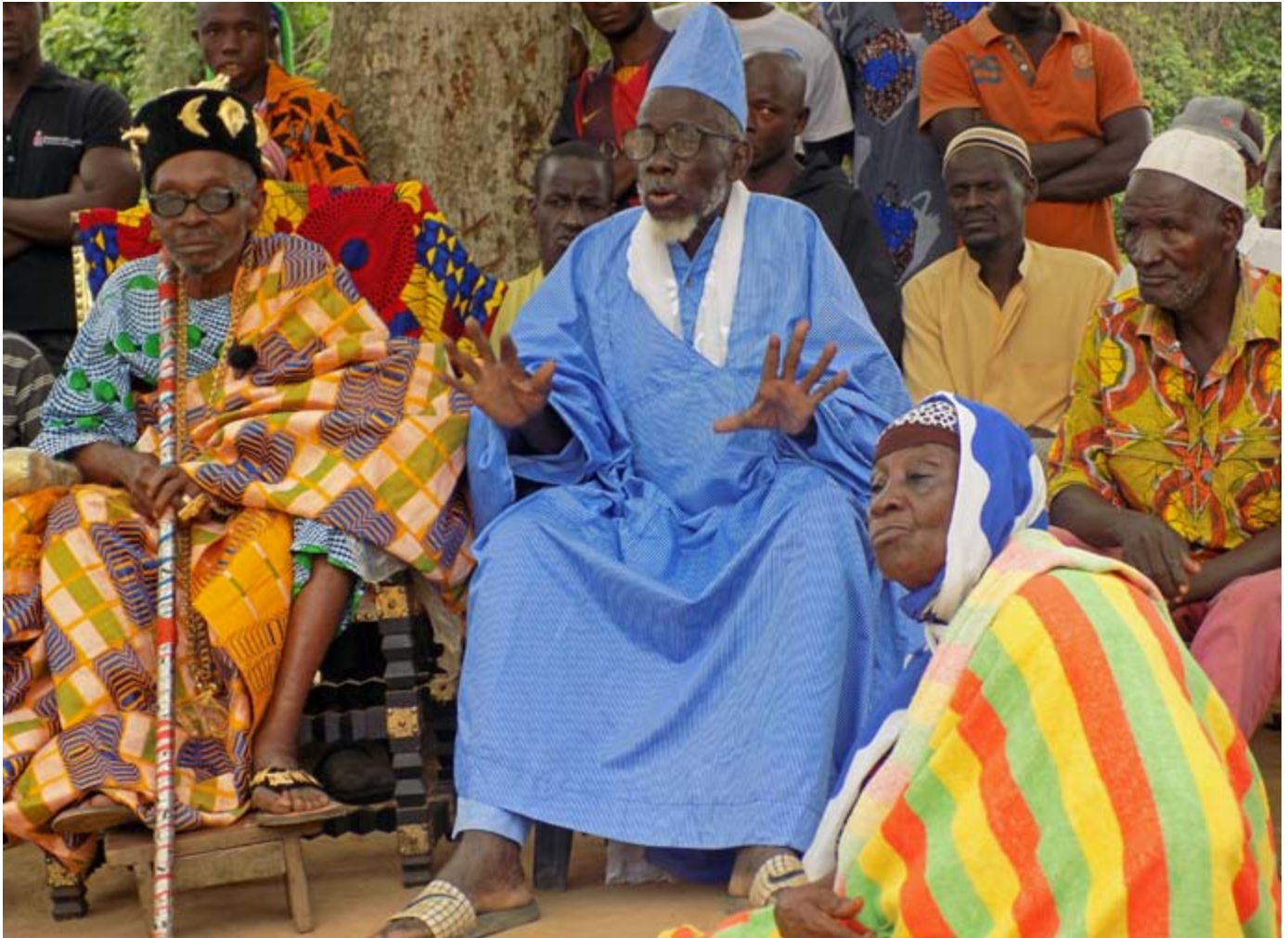
Meeting of community members affected by the rubber plantation.