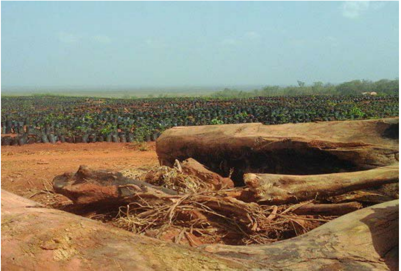
Rubber tree seedlings have replaced food crops.

end of the sugar project, the peasants had returned to farming on the site.