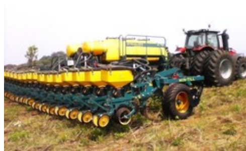
The DRC government spent $83 million setting up the 75,000 ha Bukanga Lonzo park, where a South African consortium called Africom has been handed the management contract.

However, small farmers said the government should focus on helping those already in place rather than handing large swathes of land to foreign investors.