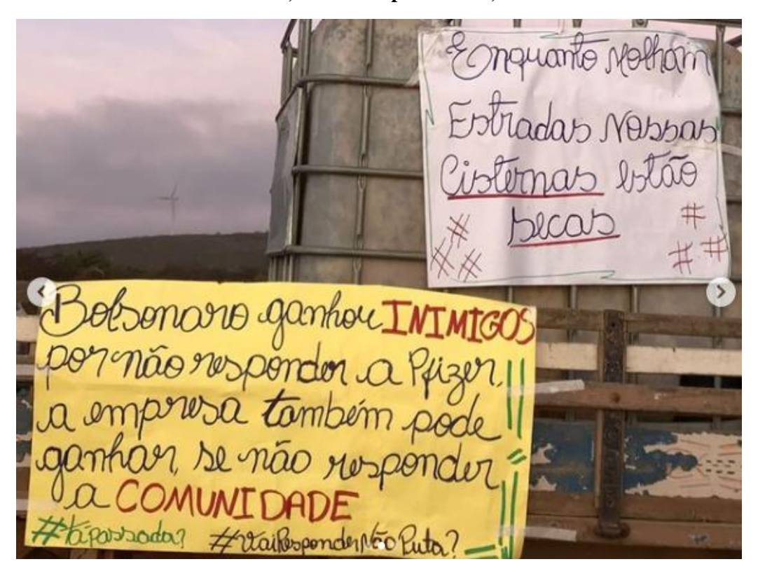
Photograph 03: Posters at the demonstration at the Morrinhos Wind Farm, in Campo Formoso, Bahia – September 20, 2021.