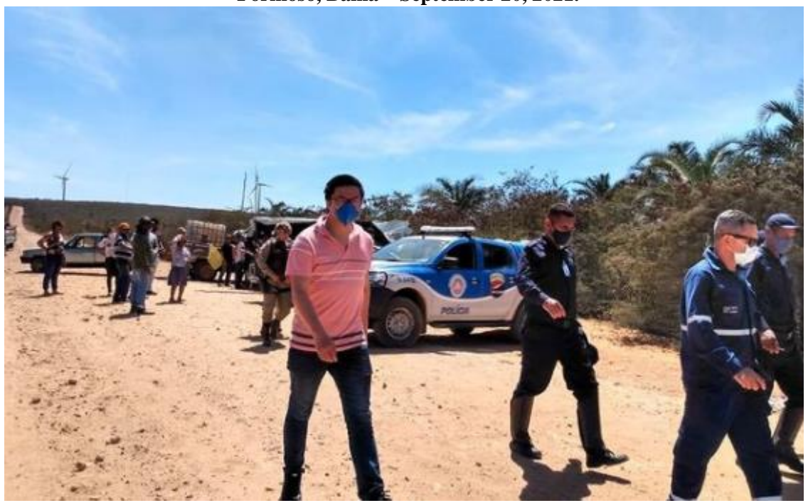
Photograph 04: Blockage in the access road to the Morrinhos Wind Farm, in Campo Formoso, Bahia – September 20, 2021.

The negotiation lasted about three hours and CGN Brazil Energy called the Military Police to the mobilization, in an attempt to intimidate the community, an attitude understood by the protesters as arbitrary and unnecessary. According to the post, residents reported that members of the Military Police asked only to maintain order and peace in the area. There was no position from the Municipality of Campo Formoso on the case. Photographs 04, 05 and 06 record the presence of the Military Police in the action at around 6 pm on September 20, 2021.