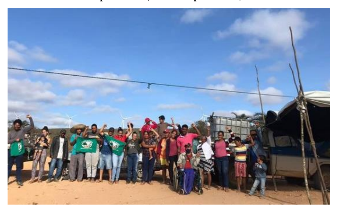
Photograph 07: Blockage in the access road to the Morrinhos Wind Farm, in Campo Formoso, Bahia – September 21, 2021.