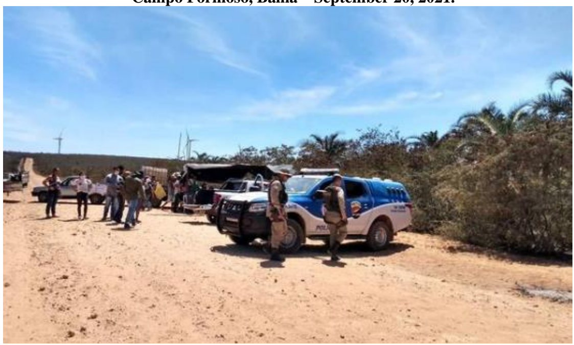
Photograph 06: Blockage in the access road to the Morrinhos Wind Farm, in Campo Formoso, Bahia – September 20, 2021.