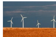
Clean energy helps to preserve natural beauty