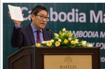
Minister attached to the Prime Minister Secretary General, Council of the Development of Cambodia.

On behalf of the Council for the Development of Cambodia, I would like to welcome you. I believe that you are able to acquire the most current investment information in this website. This website represents our continuous endeavors to promote the development and investment in Cambodia. Read More»