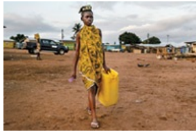
A Water Crisis Threatens Ghana's Economic Growth