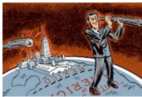
Mexico: The Stranger Next Door