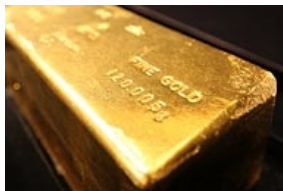
The Price of Gold Is Crashing. Here's Why