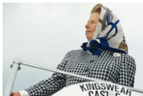
Margaret Thatcher's Forgotten Tax Increase

Benso Oil Palm Plantations Ltd. (BOPP), a unit of Wilmar International Ltd. (WIL), rose to the highest on record after saying it will expand projects in Ghana to meet rising demand for the commodity.