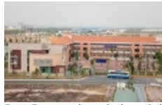
Bau Bang urban-industrial zone promotes local growth

RSS Marketing Contact TV LIBRARY CUNG&CAU NEWSPAPER NEW CITY Sitemap ↑ Top Page