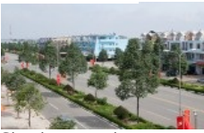
Shaping a modern civilized district