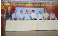
Binh Duong Customs announces 37 online public administrative procedures