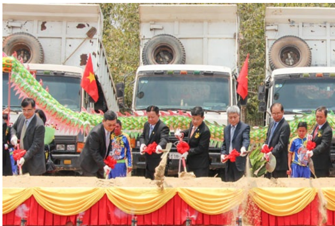
Delegates at the groundbreaking ceremony for construction and development of Bau Bang urban-industrial park

To grasp investors' demand at present and in the future, Investment and Industrial Development Corporation (Becamex IDC) has continued expanding Bau Bang urban-industrial zone by 1,000 hectares, bringing its total area so far to more than 3,200 hectares. It is expected that Bau Bang district's total population will surge 200,000 people in the coming time, meeting the local demand for workforce as well as urban-service development, absorbing more investors.