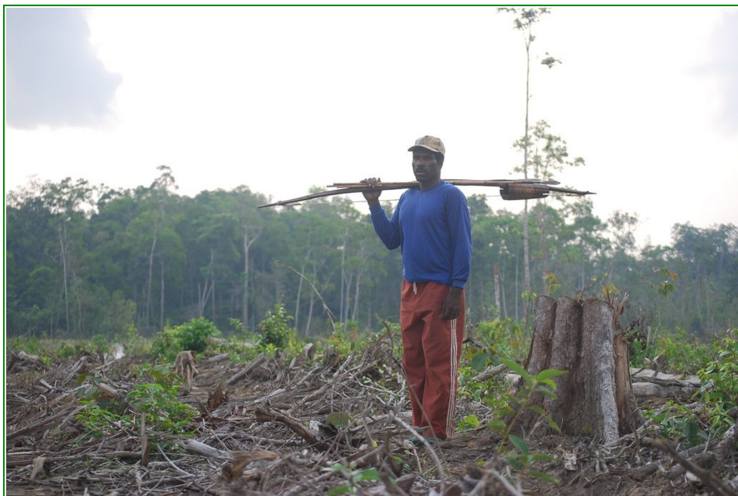
A hunter from Boepe village stands in forest cleared for MIFEE

This aim of putting together this info-pack is to provide a tool for action or campaigning around MIFEE (or for that matter, the other topics it encompasses such as food sovereignty, agrofuels, the rights of indigenous communities or the Papuan people's struggle.) The first part gives some background information about the people and ecology of the Merauke region, as well as the political context of West Papua. This is followed by an in-depth look at the MIFEE project, including a critique of the rationale behind it, a description of how the project has developed and testimony from affected villages throughout the area. In part three, consideration is given to some other important aspects of MIFEE, the impact of a population flow into West Papua and how the food estate model could affect farmers throughout Indonesia. Finally, profiles are given of many of the companies which are thought to be involved in Merauke. The profiles include first attempts at tracing links with these companies' activities globally, in the hope that these companies can also be held to account in other countries for their activities in Merauke.