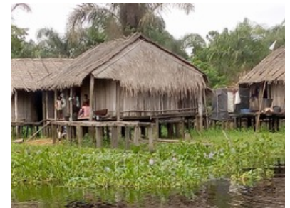
Villages homes before they were burnt.

When OOPC was established in 1976 as a federal government pet project on the ancestral land of Okomu Kingdom, it was hailed as another mile stone in economic recovery and development. Now it is no longer the case, often when people in the area talk about OOPC, they cannot talk of the development benefits; instead they are critical on the company's negative impact on the communities. It is sad that some contractual provisions which required joint implementation (Communities, Government and Company) were ignored and poorly executed e.g (FPIC, EIAs). Now the oil palms plantations have expanded to the door steps of the people. Their farms and farm lands have been swallowed up, while there are no alternative options for the people. So the men, women and youths are out of jobs, hungry and restless. The resulting effect this has brought are food insecurity and other attendant vices.