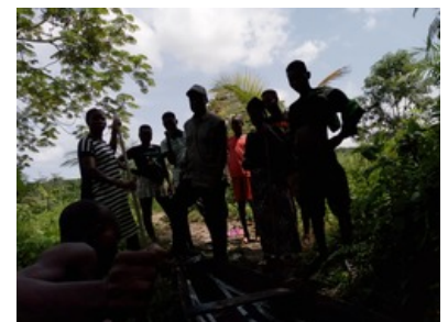
Villagers from Ijaw-Gbene in Okomu Kingdom who had their homes burnt down on 20 May 2020 by agents of the Okomu Oil Palm Plantations Company.

Giving this background, this report aims to make public the dire situation the people of Okomu Kingdom are facing in the hand of Okomu Oil Palm Plantation Plc (OOPC).