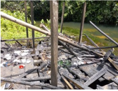
Burnt home of one of the village families.

where she was detained. All appeal to get her released failed from the 15th to 17th before she was bailed with the sum of N80,000. While the burning down of the village took place on the 20th of May.