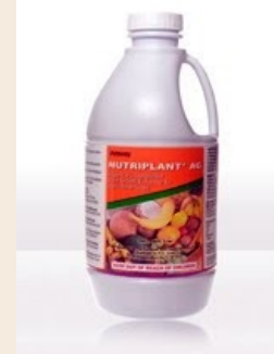
Nutriplant AG Organic Foliar Fertilizer