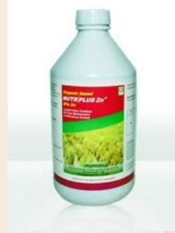
Nutriplus Zn+ Zinc