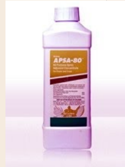
All-Purpose Spray Adjuvant