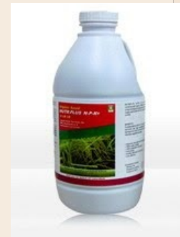
Nutriplus N-P-K+ 4-18-18 Organic Fertilizer