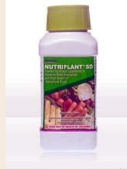
Nutriplant SD SL Organic Seed Nutrients