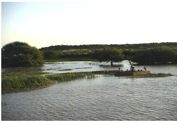
Open pond and open well submerged in the monsoon rains. These are major sources of drinking water for the village (first author)