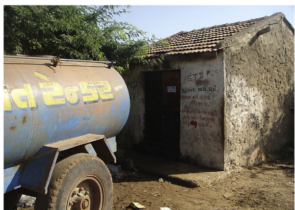
Temporary tanked water treated and supplied in large bottles to the solar park developers