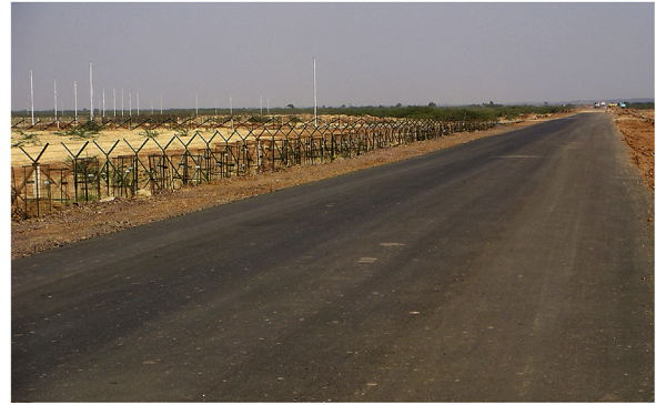
The 30km stretch of road connecting the solar park site and the National Highway under development

Considering the lack of basic services in the village, some expert interviewees also expressed their future vision of physical and social infrastructure development in the village. However, the expert interviewees concluded that while there were a range of proposals for facilities, the task of completing the project on time was their foremost priority and any plans about community development would be given thought after the completion of the project: