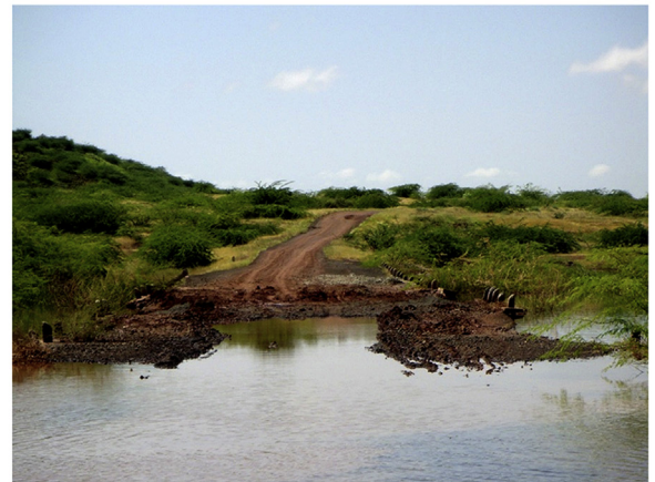
The 30km length narrow road connecting the village to the Taluka broken and drowned during monsoon