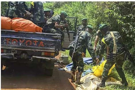
Rebels attack a gold mine in eastern Congo, killing at least 12 people