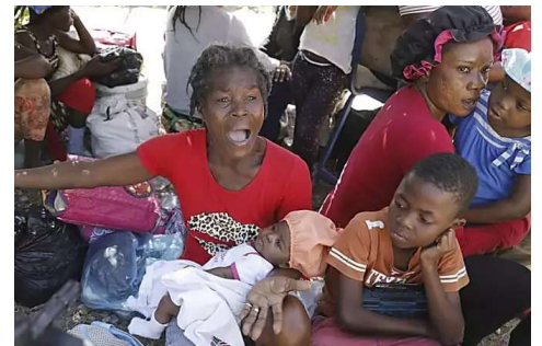
Haiti says it is working on an agreement with Kenya to secure a long...