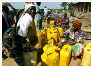
A Congolese woman buys palm oil to make her meal in Bunia's market in the northeast of the Democratic Republic of Congo on June 19, 2003.