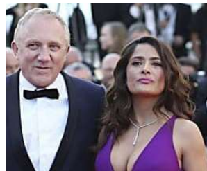
What the Wives of the Richest Men in the World Look Like SkipandGiggle.com