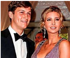
Photos Inside Ivanka Trump's New Home Will Leave You Speechless LifeDaily.com