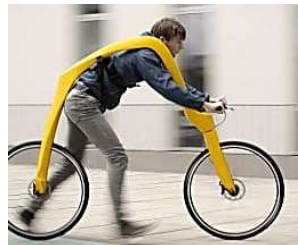
Top 10 Luxury Bicycles

Market Intelligence directly by clicking here .