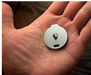
Best Tracking Device