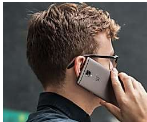
Why The OnePlus 3T Should Be Your Next Phone | StuffTV OnePlus 3T