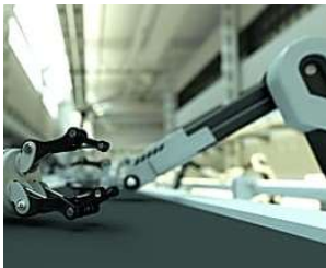
Tech Insight: What the