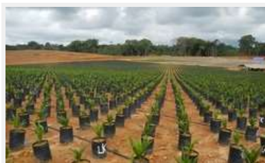
A Golden Veroleum Liberia plantation in Liberia.

In light of the GVL's land grabs, violent abuses, and the legal void that could easily lead to a repeat of similar issues, Global Witness has called on the Liberian government to investigate the case and introduce legislation governing the agricultural sector and protecting the land rights of rural communities.