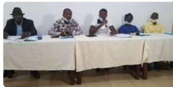
Representatives of communities affected by SAFACAM

Yaounde, 1 July 2021: Today, local communities hold a press conference to protest against the Roundtable for Sustainable Palm Oil (RSPO) certificate awarded to Socfin's daughter company SAFACAM in Cameroon on 30 December 2020. The communities allege that SAFACAM does not comply with various social and environmental RSPO principles and criteria. The certificate was awarded by certification body SCS Global Services (SCS) despite a flawed process, that did not take important information from relevant stakeholders into account.