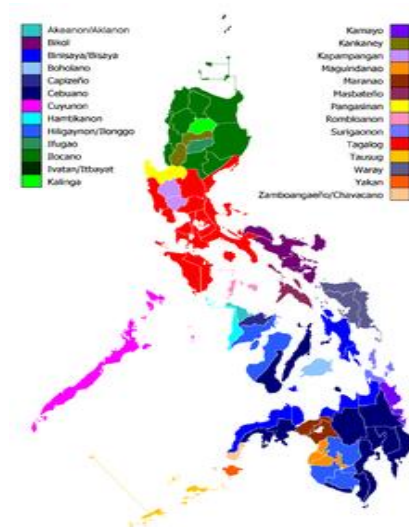
Distribution of various Indigenous Peoples groups by province

A culturally diverse country comprising more than 7,000 islands spread over a total land area of 300,000 square kilometers, its main development challenge is combating poverty. This is further exacerbated by the latent and long-running insurgency waged by the Communist New People's Army in many parts of the country and the simmering secessionist movement in Mindanao. This has serious implications for the estimated 14 to 17 million Philippine Indigenous Peoples, most of whom are concentrated in the rugged upland areas of the Cordillera Administrative Region in North Luzon (33%) and in many of the remote regions of Mindanao (61%).