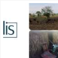
A land grab case against Agilis