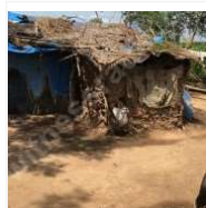
Uganda: NGO claims Agilis