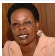
Lands minister orders