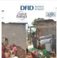
Uganda: World Bank financing