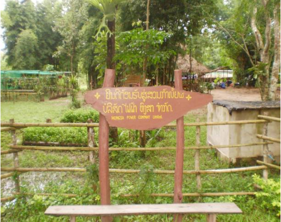
Nursery tree garden of Hongsa Power Company united.

Other information the company discloses to public communities in Hongsa. For example, before they construct or relocate households from the project area, they organize a meeting with villagers and explain the reasons why some villager have to move and lose farmland.