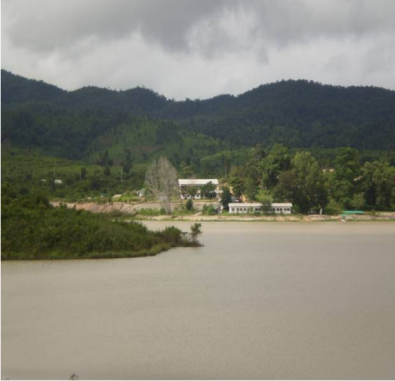
Nam Hoy Kong Kold Mai reservoir.