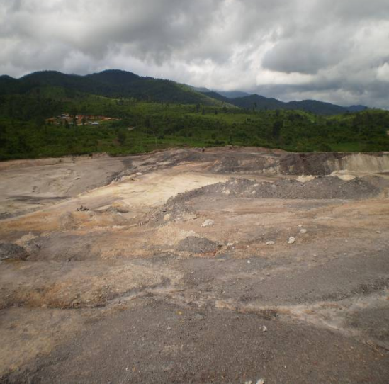
Open surface mine in Hongsa Coal-fired power plant.