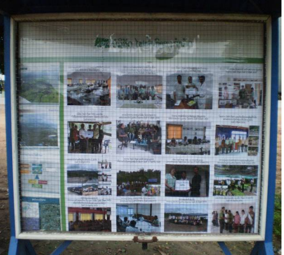
The Public information board of the company in Hongsa district

Most information on positive development activities is disclosed, but the company fails to mention about impacts of coal-fired power plants