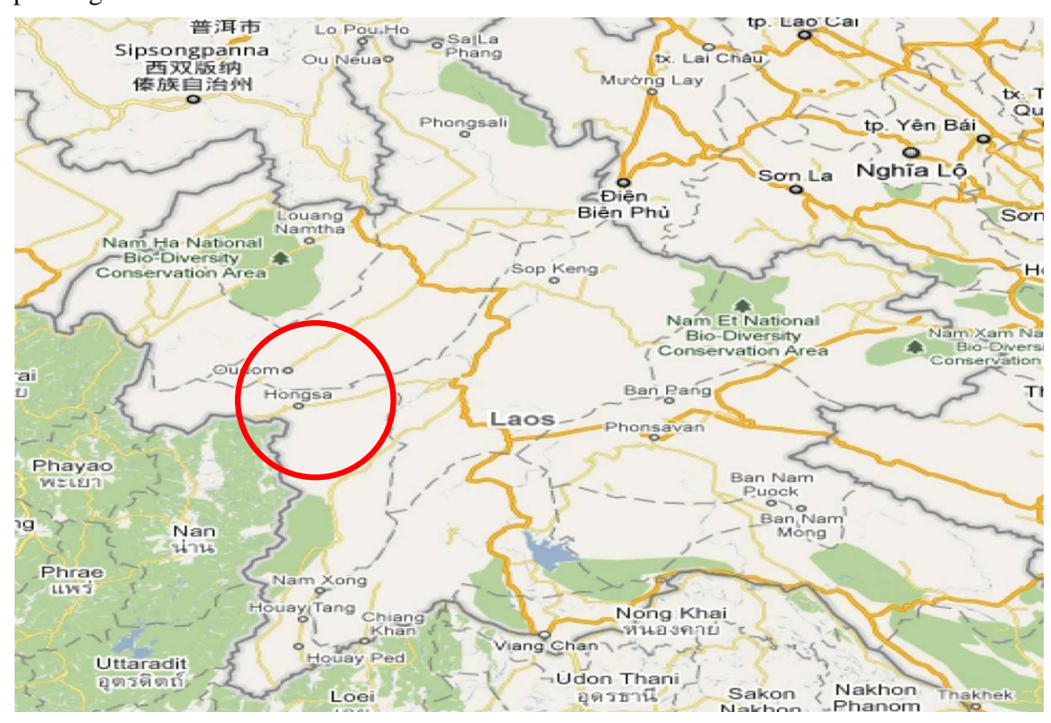
Hongsa Coal-fired power plant

The project comprises a large open pit lignite mine which will supply fuel for a power plant consisting of three (3) 626 MW (gross) generating units. Water supply for the power plant will be from 2 reservoirs on Nam Louak (upstream of Muang Hongsa) and Nam Kene (downstream of Muang Hongsa). A double circuit 500 kV transmission line will be built over a length of approx. 67 kilometres to the Thai/Laos border to deliver power to the EGAT power grid<sup>4</sup>.