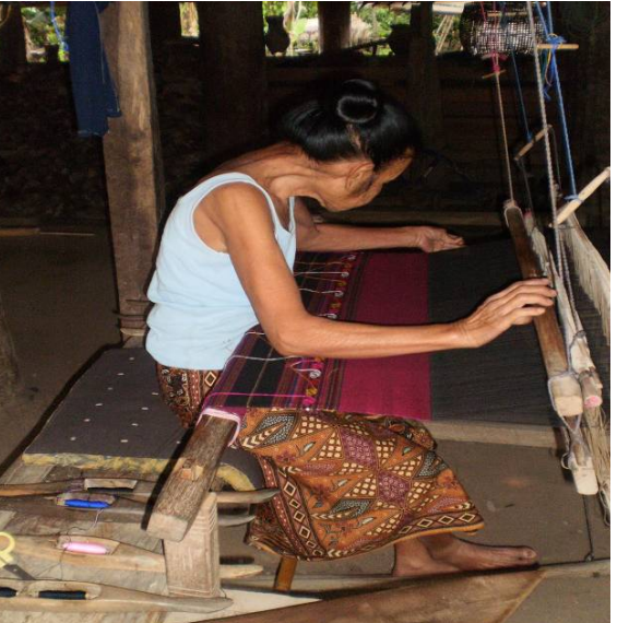
Local Farmland (rice field) and an old woman weaving traditional cloth