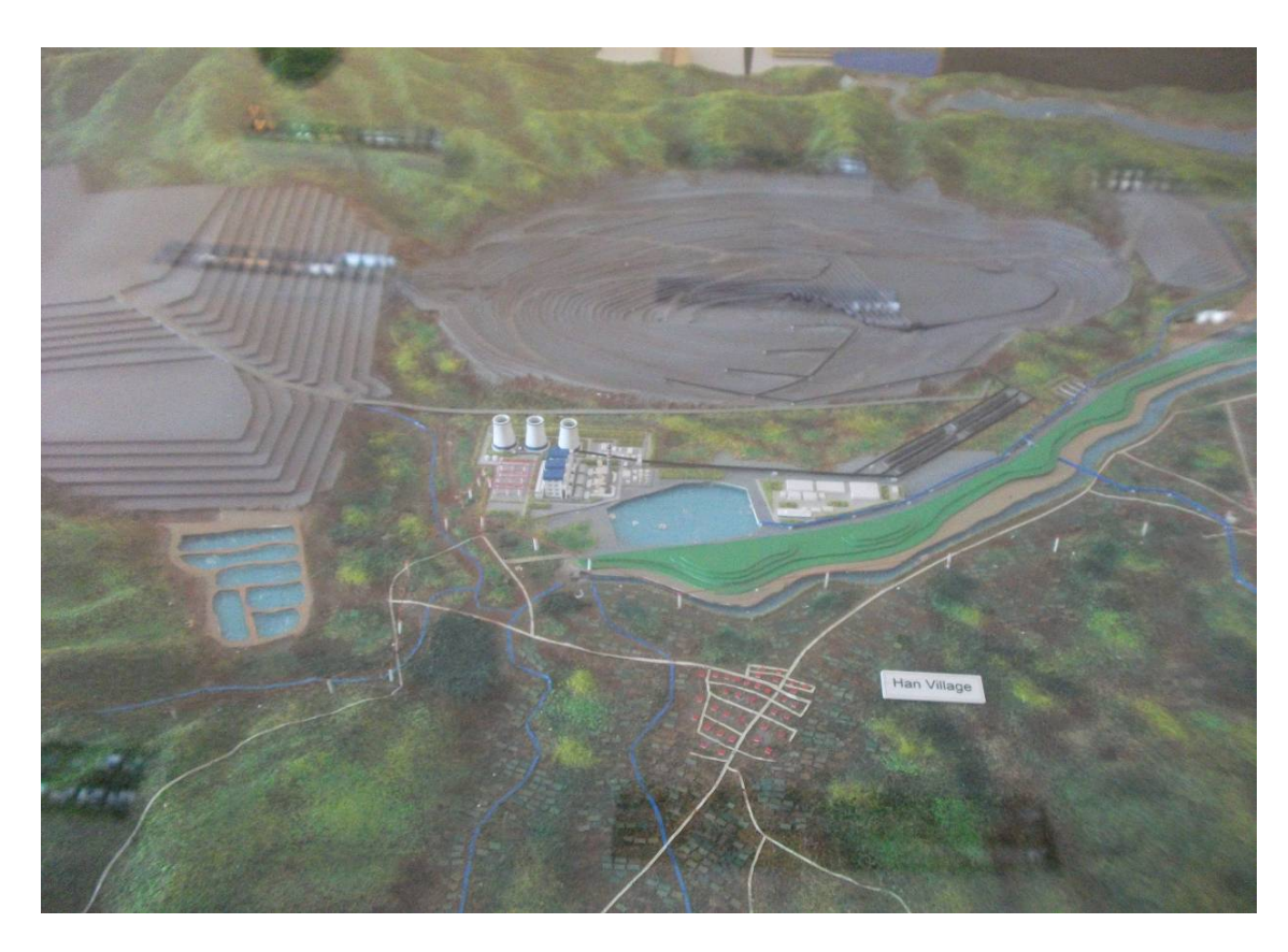
Hongsa Coal-fired power plant Model

The construction of the lignite coal-fired power plant will cost about 30.2 trillion kip (US$3.7 billion) with 70 percent financed by loans and the remaining 30 percent provided by the company.