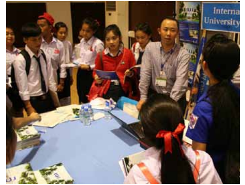
Students seek information at the fair in Vientiane.

The fair offers an opportunity for students and teachers to meet representatives from eight famous Japanese universities, Osaka University, International University of Japan, Nagasaki University School of Tropical Medicine and Global Health, Nagoya University, Yokohama National University, Ritsumeikan Asia Pacific University and University