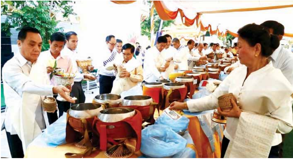
Prime Minister Thongsing Thammavong joins worshippers to make merit on the last day of Buddhist Lent at Ongteu temple in Vientiane.