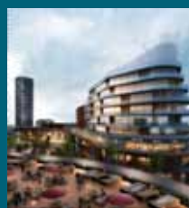
World Trade Center office set to open soon PAGE 8