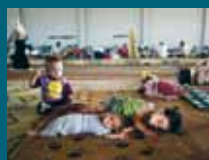
Syrian refugees stuck at Turkish border PAGE 7