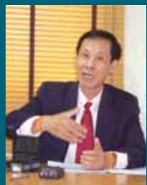
Disaster management the social and environmental topic at ASEP-7 PAGE 3