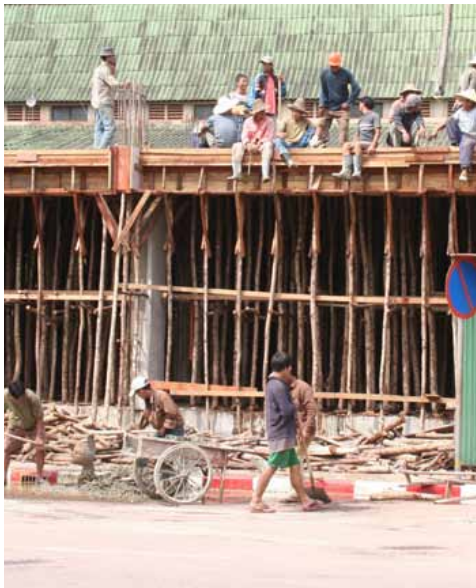
Foreign workers at a construction site in Vientiane.

By doing so the government will be able to decrease its payments for purchasing electricity from neighbouring countries and as a result domestic electrical bills may be cheaper.