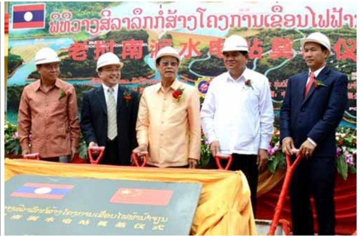
Deputy Prime Minister, Somsavat Lengsavad (centre) joins the groundbreaking ceremony for Nam Chien Hydropower project in Xieng Khuang province last weekend.

Observers have said the number of foreign workers in Laos was much higher than the figure quoted by the government and relaxed enforcement of the immigration law has created opportunities for foreign workers from neighbouring countries to work and do business in Laos. They said the government should register all foreign workers so as they have data on exactly who is working or doing business in Laos, enabling better management and also facilitating the collection of income tax.