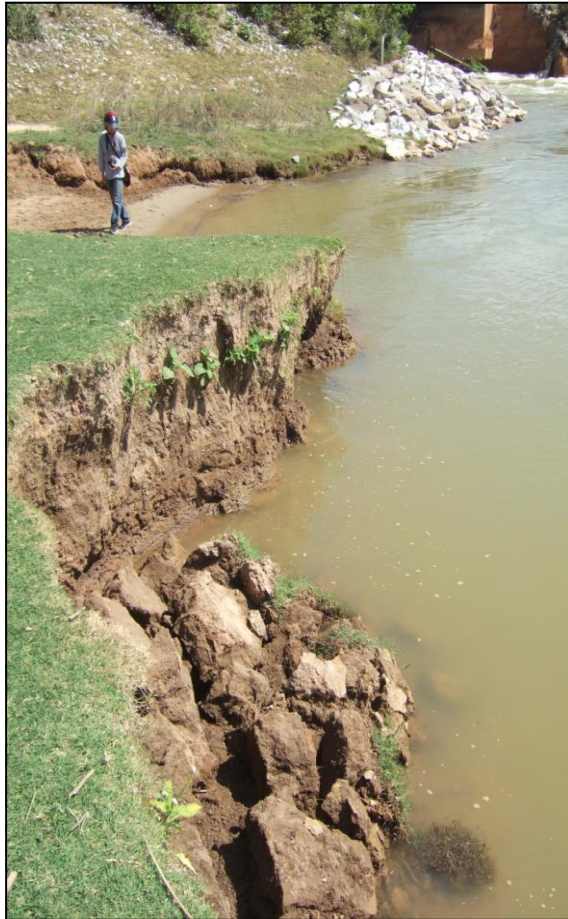
Ongoing erosion along the banks of the Hai River a few kilometers below the powerhouse November 2013.