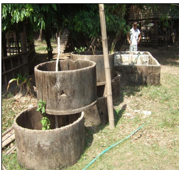
Abandoned concrete well ring and a fishpond in Nong Boua, November 2013.

Even if households were able to successfully raise fish, due to the scale limitations of this THPC-recommended model, the amount of fish that a family could hope to culture in a pond of about 6 m 2 would be just a fraction of the estimated daily consumption intake of wild fish and aquatic animals prior to project operations. For example, if a family of five were to raise sixty catfish fry over three months to an average of 200 grams each, the maximum yield of fish obtained in such a tank would be 12 kilograms. If eaten, the consumption of fish would average 26 grams per person/day. In comparison, before the Theun-Hinboun dams were built, the daily household fish catch in Nong Boua was estimated as typically providing 650 grams per person/per day (Thorncraft, 2006, p.16). Within this context, such livelihood programming cannot be considered as an adequate compensation or mitigation measure.