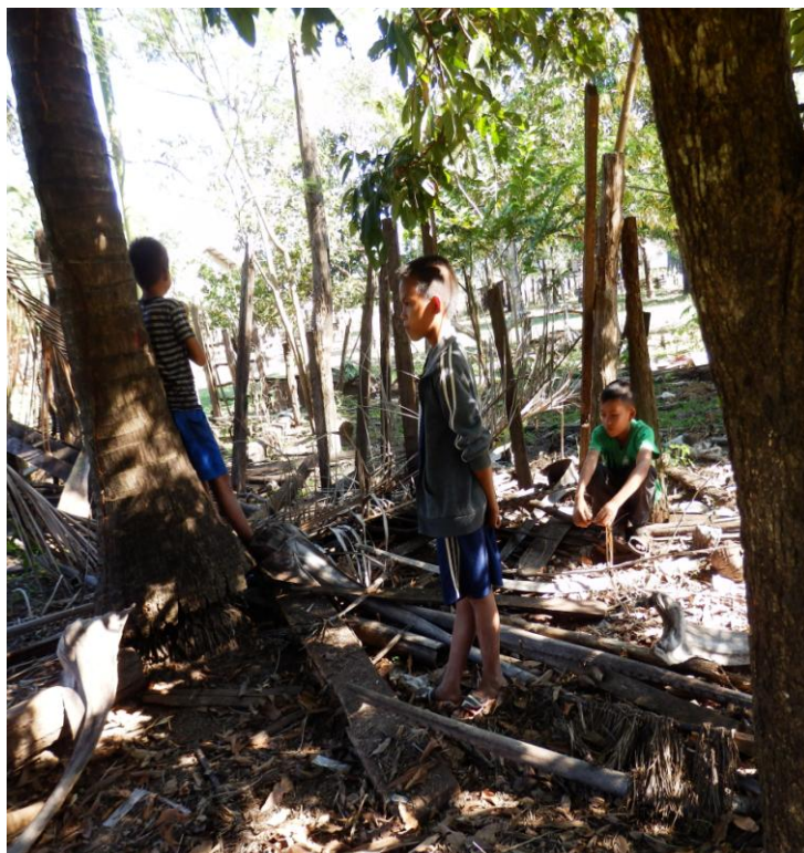
Children who resettled in consolidated village of Phousaat return to the familiar places of their old village, 2012.

The company's definitional differentiation between 'involuntary' resettlement and 'voluntary' relocation is not merely semantic, but has far-reaching implications on villagers' rights and livelihoods at this and other dam sites in Laos. Those living downstream are deemed to be merely voluntarily relocating away from the riverbanks (despite project-induced rising water levels) and are supposed to be able to continue cultivating their old fields. People classified as 'relocating' have fewer avenues for claiming compensation due to loss of productive land, less monetary support offered for housing, and are provided with a scaled-back version of livelihood programming as compared to those displaced by the reservoir. People from these villages along the river are moving to consolidated focal settlements in 'flood-safe' areas according to a schedule spanning from 2010 to 2018. Despite this process being explicitly due to the cumulative downstream impacts of the two projects, it is proceeding according to a schedule and decisions made without the informed consent, consultation or participation of directly affected individuals.