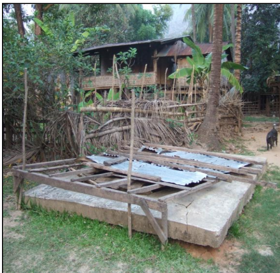
A collapsed well installed by THPC in Thana Nua, November 2013.

Villagers, including young children, continue to use the river to bathe, especially in light of the shortage of functioning water taps. In the past, concrete stairs to the river had been installed by THPC to develop safe public access points in each village. At the time of writing, these routes showed signs of serious erosion, collapse, and in some cases entire loss. However, they also reported that the risk of slipping and falling from the steep riverbanks into the fast-flowing water is of concern. They did not know how the access points would be fixed if there was no external support for the needed materials or technical equipment. Given the neglected state of infrastructure, many villagers interviewed were of the opinion that the best option for accessing better infrastructure would be to relocate to the new consolidated settlements because running water has been promised to all households.