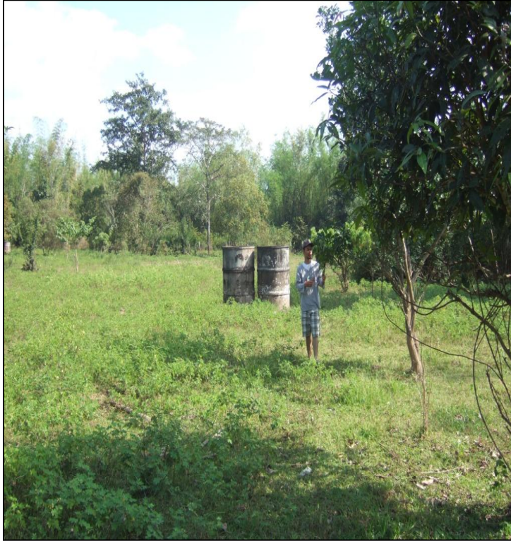
Abandoned “Suan Theun-Hinboun” in Nong Boua, November 2013.