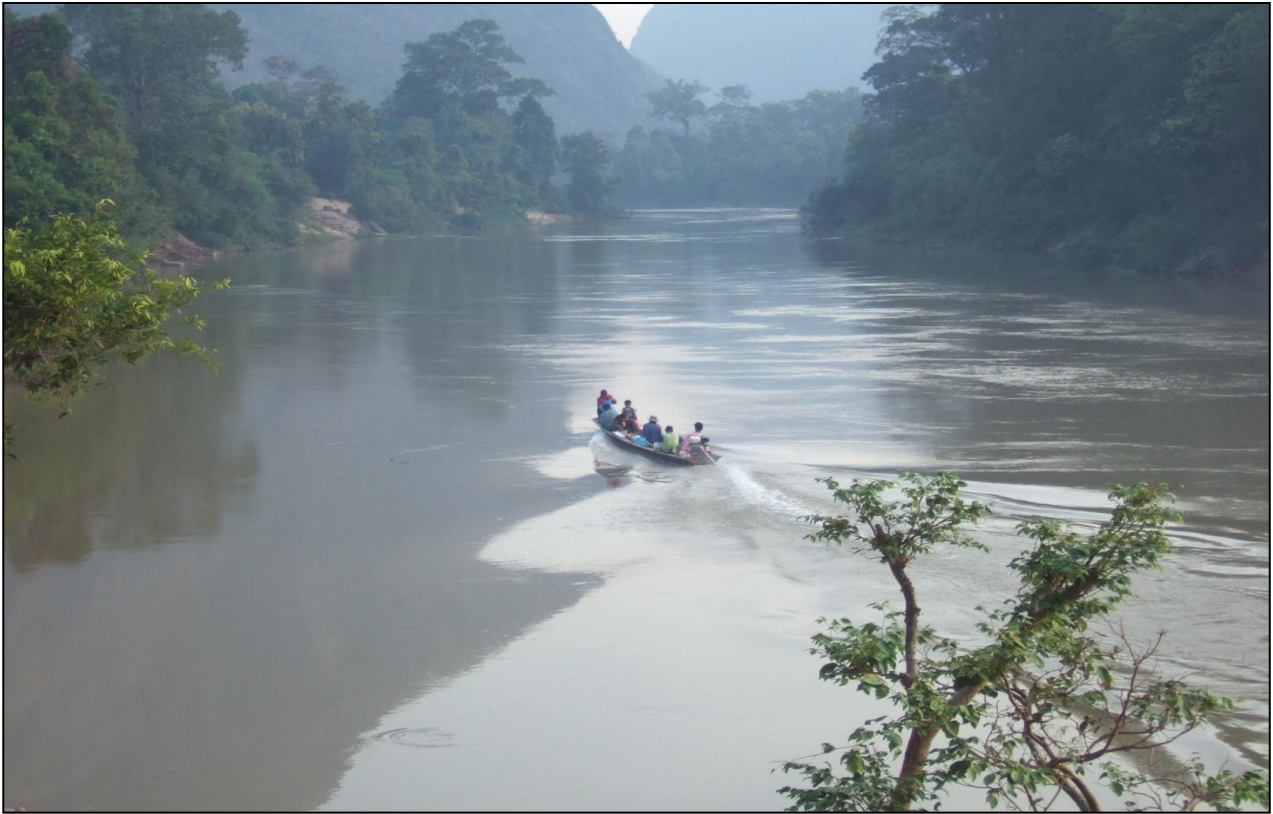
Downstream of the Theun-Hinboun Expansion Project, near the site of the planned Thonglom Dam, November 2013.