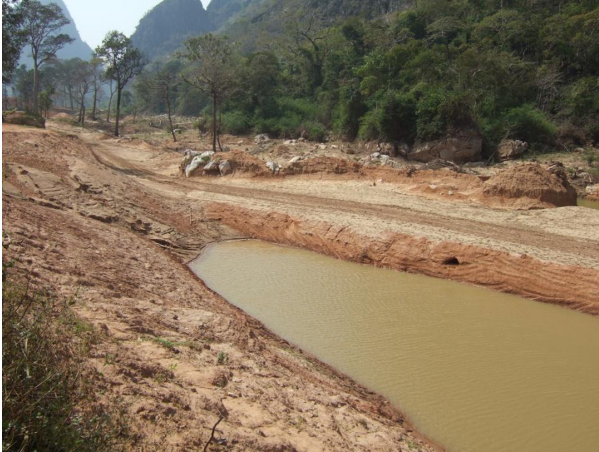
Preparatory construction for the Thonglom Dam, downstream of the Theun-Hinboun Expansion Project. November 2013.

cumulative social and ecological impacts (including emergency preparedness measures for heavy rains and flooding, timing of water releases, sediment accumulation and erosion, as well as compensation and resettlement entitlements).