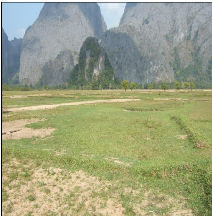
Abandoned rice paddy in Thana Nua that was flooded in August 2013. November 2013.

Instead of first agreeing to pay compensation for the loss of productive agricultural land, THPC began supporting dry season rice cultivation as a partial mitigation measure. Starting in 2001, the Social and Environmental Division of THPC began to subsidise the cost of pumps, irrigation canals, fertiliser and other inputs, while providing credit and extension advice to households that decided to switch to dry season rice. Villagers testify that although nearly all households have stopped growing wet season rice, not all households can afford to participate in the irrigated rice projects because of the comparatively high costs involved. Some families have tried cultivating irrigated dry season rice, but found it was prohibitively expensive and insufficiently productive due to a variety of technical and managerial problems experienced. They report that yields have fallen dramatically since the first few years of production, while costs have risen and subsidies from THPC reduced. If external support for this initiative from THPC is discontinued, the sustainability of this intervention is questionable.