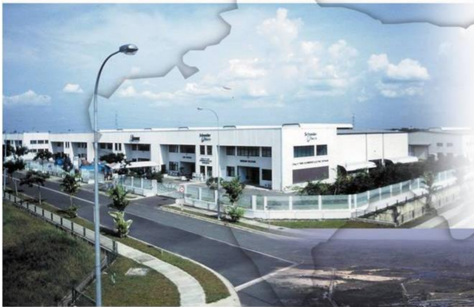
Vietnam Singapore Industrial Park, Vietnam