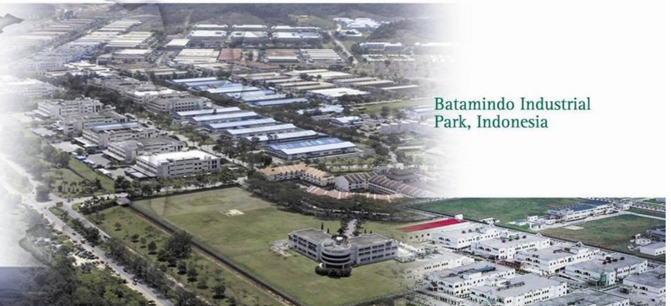
Batamindo Industrial Park, Indonesia