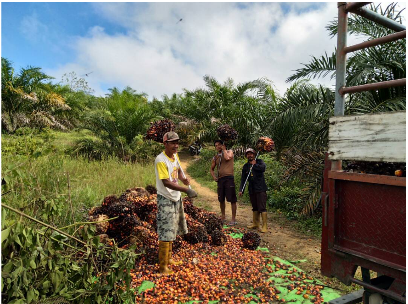
ACTIVITIES A number of residents harvest oil palm in a partnership with PT SJA II in Poso District, Central Sulawesi.