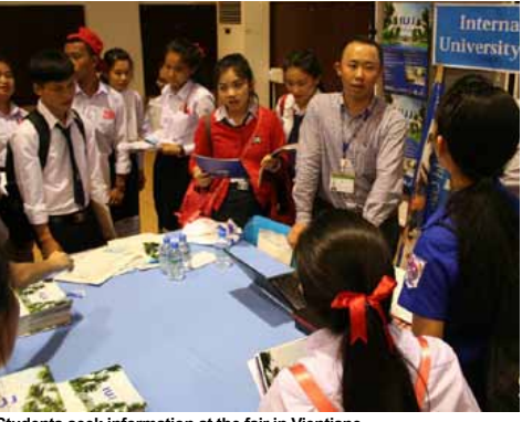
Students seek information at the fair in Vientiane.

of the Ryukyus to find out about studying in Japan.