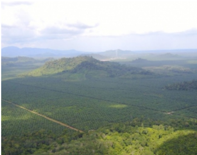
Village forests in an oil palm landscape: can they co-exist ?