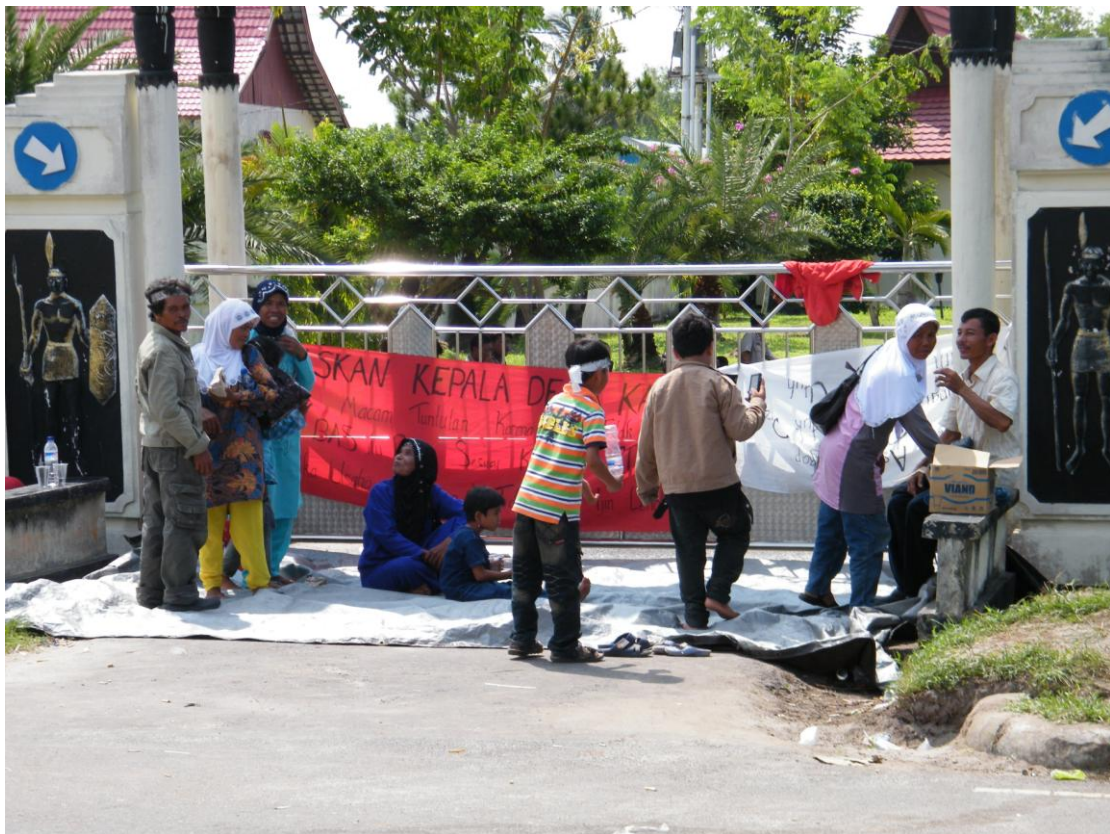
Transmigrants demonstrating at the gates of the district parliament in Sampit in protest at the take-over of their land by the palm oil company PT Buana Artha Sejahtera of the Sinar Mas Group (18 th May 2011).

While we were in the district capital, Sampit, there was a public demonstration by transmigrants contesting the take-over of their land by the oil palm company, PT Buana Artha Sejahtera, a member of the Sinar Mas group. The villagers allege that a few years ago the company took 300 ha. of their lands without their agreement. Recently their village head was arrested and charged with criminal trespass for harvesting oil palm fruits from the contested land.