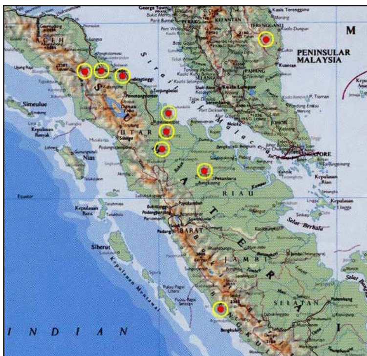
Figure 1. Oil palm estates of the Anglo-Eastern Group