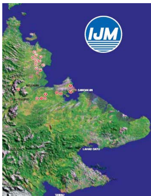
Figure 2. Location of IJM Plantations' oil palm plantations