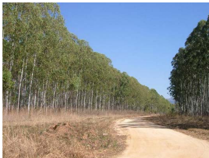
A eucalyptus plantation in Mpumalanga Province, South Africa

Sojitz Corporation established Sojitz Maputo Cellulose, Limitada (SOMACEL) as a wholly-owned subsidiary of the Sojitz Group in Mozambique to operate the project. SOMACEL will procure the log from the Eucalyptus and Acacia plantations in Mpumalanga Province in South Africa and Kingdom of Swaziland, export the log to Mozambique, and process it to manufacture woodchips. SOMACEL plans to start operations at the chip processing mill this fiscal year. The mill will supply 200,000 BDT (bone dry tons) of woodchips to Japan each year.