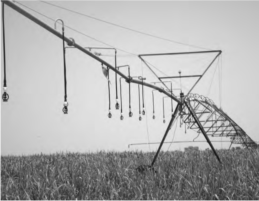
Pivot irrigation in the PSM sugarcane plantation.