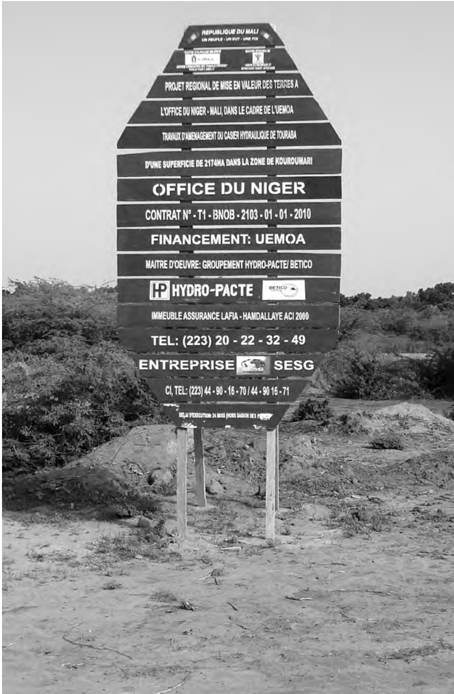
An Office du Niger board, signalling work in Touraba sector with UEMOA funding.