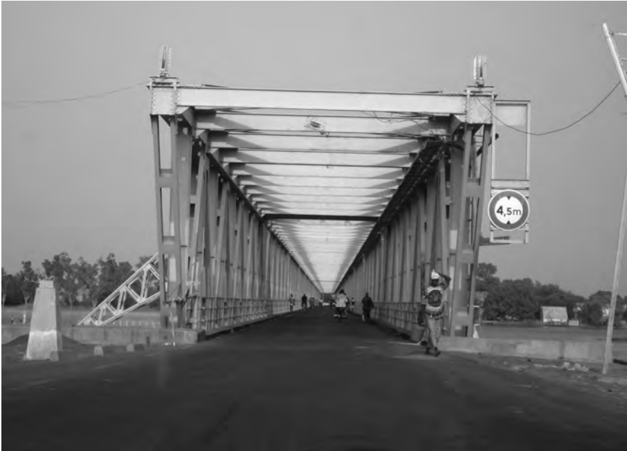
Bridge on the Markala dam.

because the necessary implementing decrees have not yet been adopted. This circumstance makes Mali's land legislation incomplete in important respects. Customary land holders that wish to formalise their rights can only do so through the procedure provided for rural concessions. This procedure is costly and cumbersome, and arguably not suited to recording customary rights.