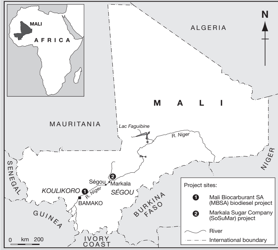
Figure 1. Location of the two project sites in Mali

resource persons, and on fieldwork based on qualitative semi-structured interviews. Interviews with resource persons based in Bamako helped frame the analysis and collect data on the two case studies. Resource persons included researchers, officials of public and semi-public agencies and private sector officers. Fieldwork focused on the two case studies. Field research was conducted in May 2011 in Koulikoro Region and in the ON area. During the field visits, collective and individual interviews were conducted with the various stakeholders, including investors, local producers, government administration, technical services and funding agencies.