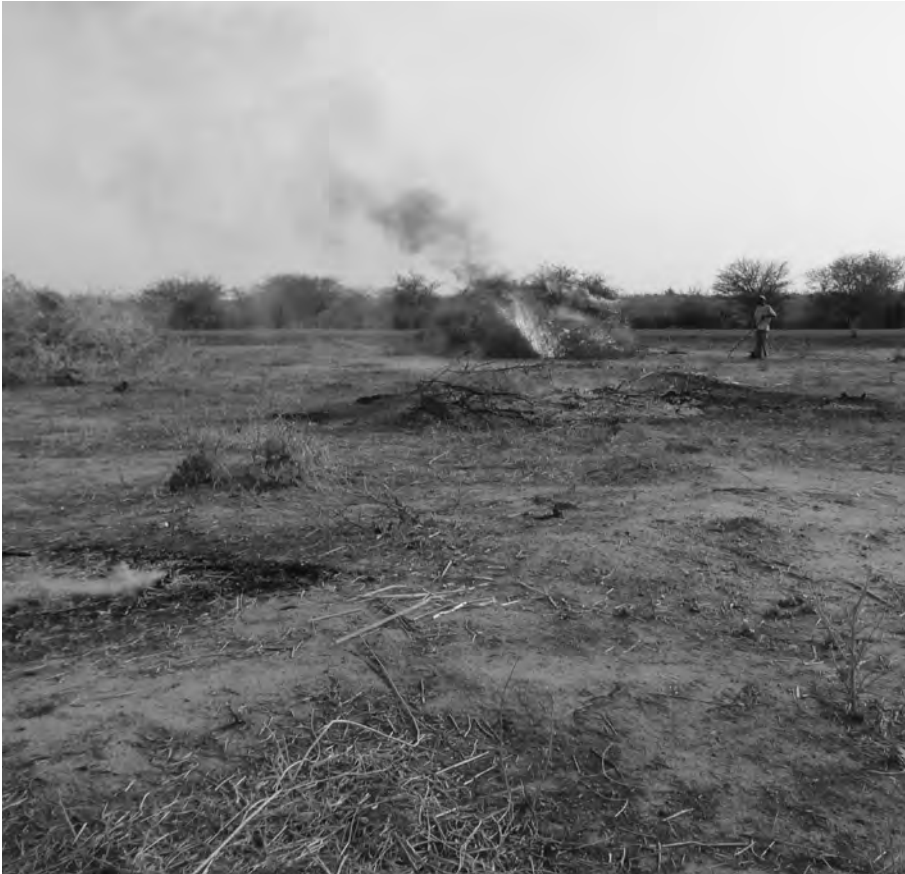
Land clearing in the Phédié area (Office du Niger).

In principle, projects subject to an ESIA cannot begin implementation without an environmental permit issued by the Minister for the Environment. The permit would require the implementation of mitigation and compensation measures recommended by the ESIA. As part of the ESIA, the project developer must inform the local people, particularly those liable to be affected by the project. Also, a public consultation must be organised by the government representative or mayor in the project area to enable local people to voice their concerns. The ESIA must be accompanied by an environmental and social management and monitoring plan (ESMP). These provisions apply to all projects, including agricultural development projects, liable to have negative environmental and social impacts. In practice, the decrees regulating the management of the social and environmental impacts of investments face major problems in implementation, as will be discussed later.