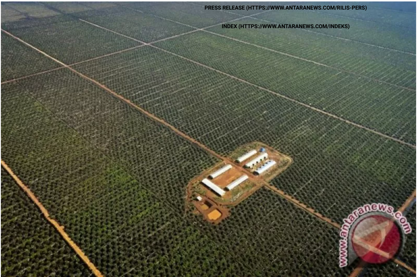
Oil palm plantations photographed from the air in the Kotawaringin Timur Regency, South Kalimantan, Wednesday (13/7). According to data from the Indonesian Palm Oil Entrepreneurs Association (GAPKI) as of June 2011, the Central Kalimantan palm oil industry generated IDR 12.6 trillion from sales of crude oil (Crude Palm Oil-CPO) as a result of harvesting 450 thousand hectares of palm oil land, with a calculation of 4 tons of CPO per hectare. per year, for IDR 7 million per ton.

INDEX ( HTTPS://WWW.ANTARANEWS.COM/INDEKS )