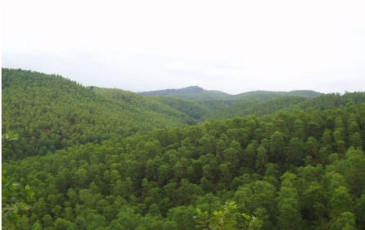
View of a QPFL plantation site