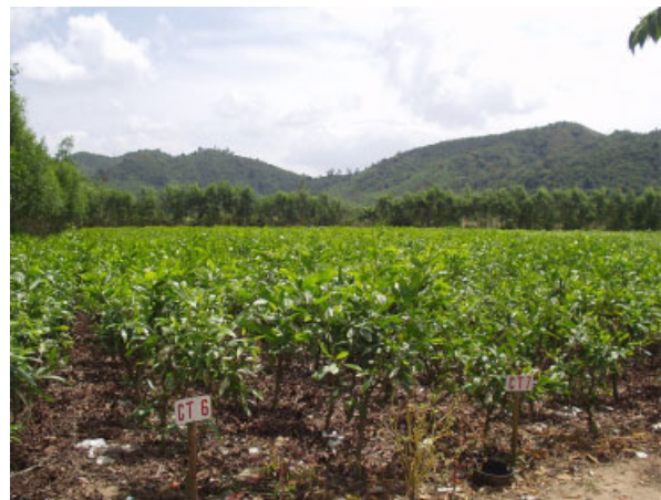
QPFL's seedling fields