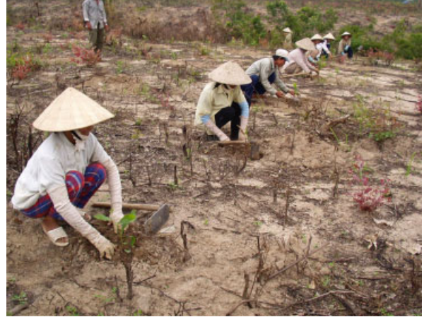
Seedlings being planted on degraded land owned by QPFL