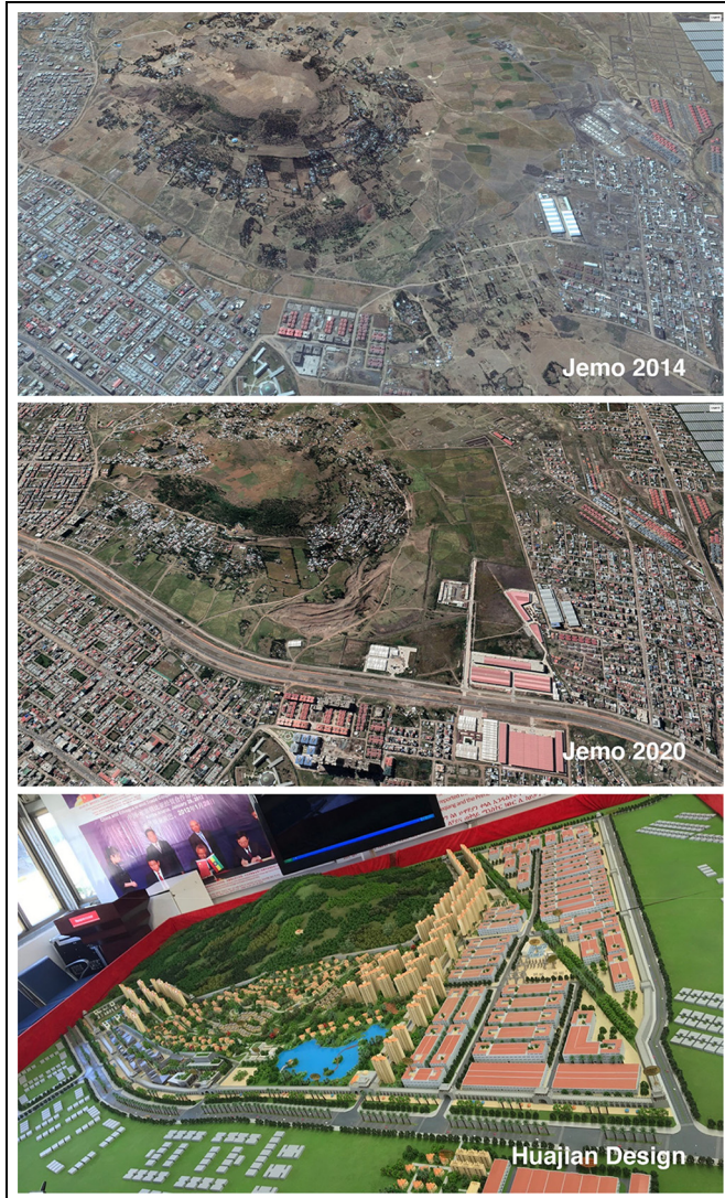
Figure I. Huajian Light Industry City and Jemo area.

Group engaged in what one senior representative termed ‘hundreds of pleas to different levels of government and millions of meetings’, as well as study visits to China, in order to acquire a letter from the Ministry of Industry to allow them to experiment with leasing land as a ‘special case’. Making sub-division a standard practice required